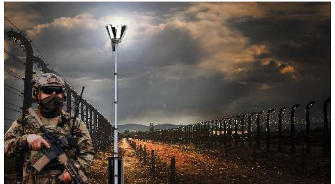
Law Enforcement | Military Operations