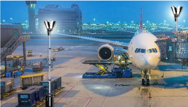
Airports | Maintenance Work Construction Sites | Road Construction OffGrid Work | Sports