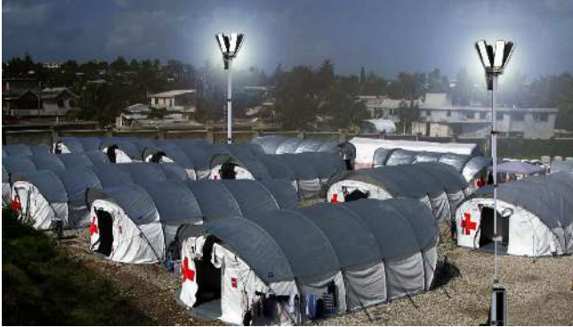
Rescue Operations & Disaster Relief